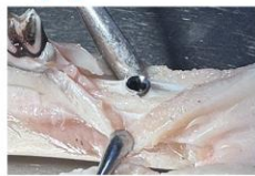
Dummy Implant Placement