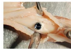
Regeneration of Peri-implant defect