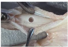
Flap Management (Design and incision)